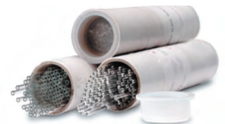
Melting point tubes